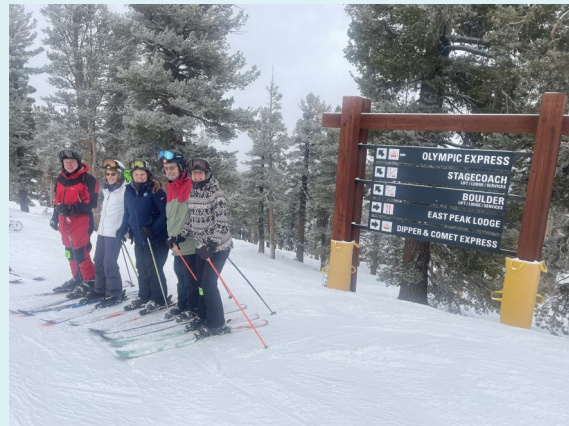
A few skiers pause before they head over to the 2 mile long Olympic run.