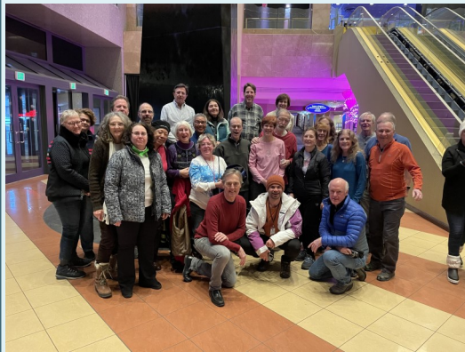
The Group photo was taken in the lobby of Harvey's Casino and Hotel at our last get together of the trip.

On February 3 rd thirty-eight club members departed BWI Airport for Reno for a week of skiing at Heavenly Resort as part of the BRSC Western Carnival. We lucked out because Tahoe had back-to-back snow storms the week before we left and picked up additional snow just about every day we were there! 98% of the Heavenly terrain was open and we enjoyed skiing from Nevada to California on fresh snow every day. In addition to getting a fair amount of snow during the week, there were at least two beautiful blue-sky days with great views of the lake from the slopes. Harvey's Hotel and Casino, where we stayed, had large rooms with views of the lake and mountains. The hotel was a short walk to the Heavenly gondola and a good variety of dining places.