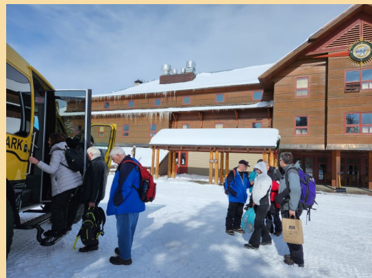
Snow Lodge and Snow Coach