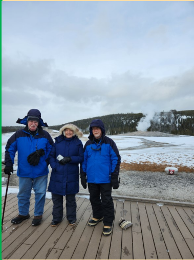
Fountain Paint Pot

If you're skiing with the Columbia Ski Club at Jackson Hole or Big Sky and would like to extend your trip in Montana or Wyoming, check out the winter packages at Yellowstone National Park offered by Xanterra ( https://www.yellowstonenationalparklodges.com/packages/ ). Four ski club members just returned