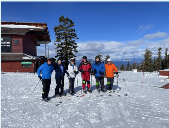
A great part of Heavenly Mountain are the magnificent views of the lake

The BRSC Western Carnival activities included a Welcome Après Ski Party on Sunday, a Mid-Week Après Ski Party on Tuesday, and a Farewell Dinner Dance on Thursday night. The Farewell Dinner Dance was especially memorable because the Columbia Ski Club participants filled most of the dance floor for a while. Everyone had a good time! The BRSC events provided an opportunity to meet people from other MD ski clubs and catch up with old friends. On the other nights, small group dinners were arranged at restaurants inside the hotel and Heavenly Village. BRSC also organized excursions to NorthStar and Kirkwood Ski resorts which were enjoyed by several club members. Everyone arrived home safely and in plenty of time for the Super Bowl on Sunday.