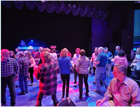
We were surprised to see so many trip members enjoying the music and dancing at the farewell dinner dance!

On February 3 rd thirty-eight club members departed BWI Airport for Reno for a week of skiing at Heavenly Resort as part of the BRSC Western Carnival. We lucked out because Tahoe had back-to-back snow storms the week before we left and picked up additional snow just about every day we were there! 98% of the Heavenly terrain was open and we enjoyed skiing from Nevada to California on fresh snow every day. In addition to getting a fair amount of snow during the week, there were at least two beautiful blue-sky days with great views of the lake from the slopes. Harvey's Hotel and Casino, where we stayed, had large rooms with views of the lake and mountains. The hotel was a short walk to the Heavenly gondola and a good variety of dining places.