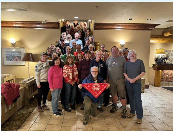
Last night at the Lodge.